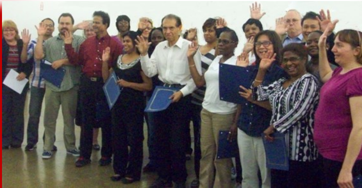
PLR Team—First Shift

Department of Homeland Security (DHS); U.S. Citizenship and Immigration Services (USCIS); Service Center Operations Support Service (SCOSS); Texas Service Center (TSC)