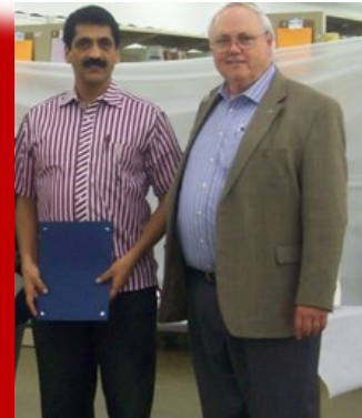
PLR Team—Second Shift