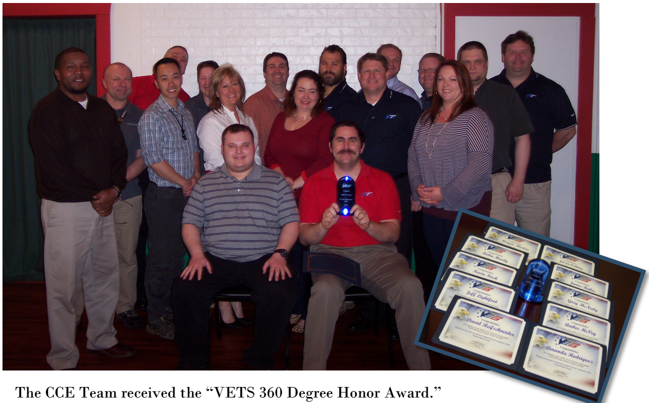
The CCE Team received the "VETS 360 Degree Honor Award."